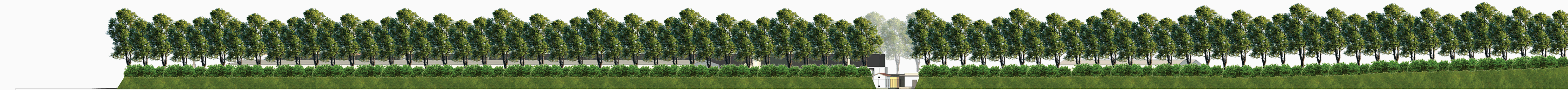
2 ALZATO OVEST 1 : 200