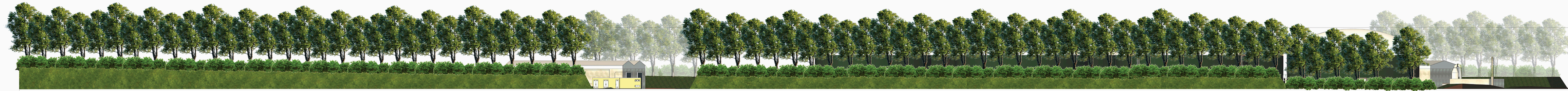
1 ALZATO EST 1 : 200