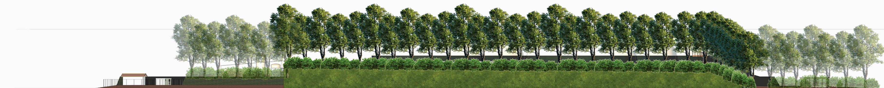
4 ALZATO SUD 1 : 200